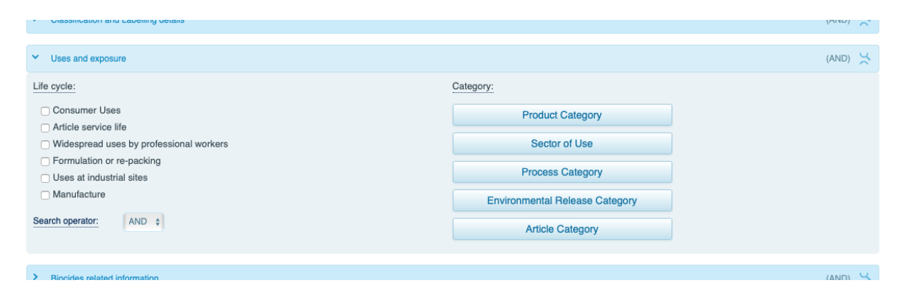
Figure 4. The sub-menu "Uses and exposure" in the "Advanced search" function of the ECHA database.

Search results obtained from the ECHA database are downloaded as Excel files for further processing. The downloaded files contain the substance name, EC number, and CAS number, if available. Processing includes the following steps: