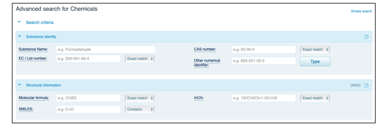
Figure 3. The sub-menu "Structural information" in the "Advanced search" function of the ECHA database.

Instead of defining a complete SMILES code for one molecule, the search for substances within chemical substance classes requires the definition of a SMILES code fragment, which represents